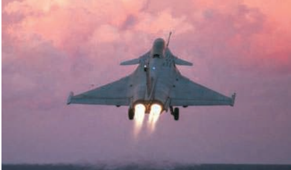
Manufactured by French aerospace company Dassault Aviation, the Rafale-Marine combat jets will be deployed on the INS Vikrant, India's first indigenous aircraft carrier

The contract covers 22 single-seater jets capable of operating from an aircraft carrier,