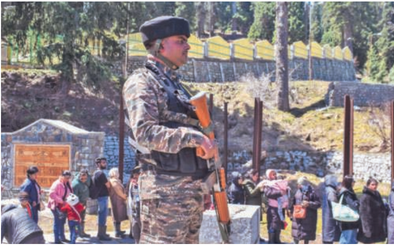
A security personnel stands guard as tourists line up at a Gondola cable car station at Gulmarg in Baramulla district of Jammu & Kashmir

In New Delhi, members of the parliamentary standing committee on defence observed two minutes' silence in memory of those killed in the terror attack. According to sources, there were no inconvenient questions to the government. Opposition members said it was in the spirit that they supported the government in responding to the terror attack. The Congress also asked its leaders and