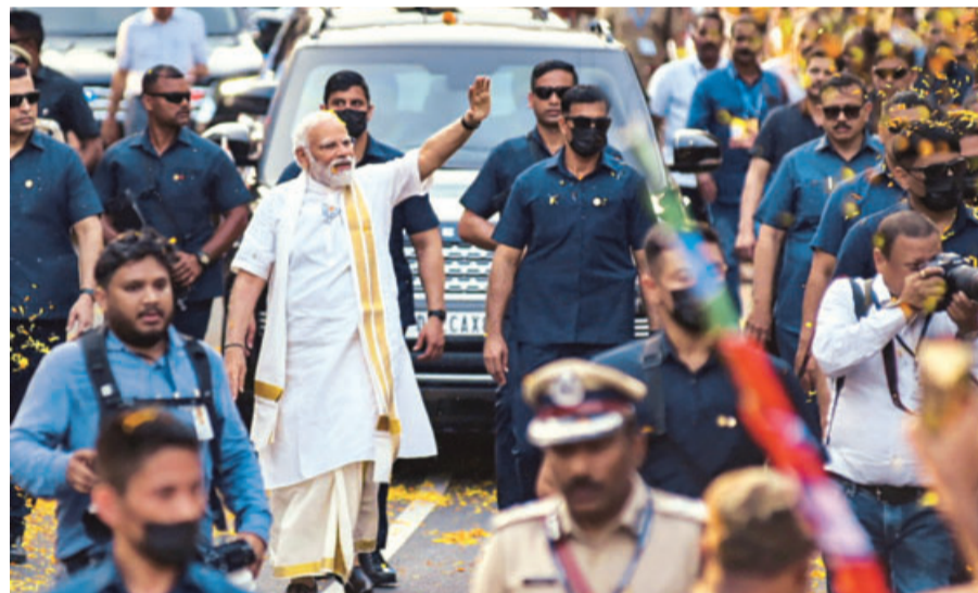
Prime Minister Narendra Modi received a rousing welcome after he arrived in Kochi on Monday, with thousands of people, including BJP workers and supporters, lining up on both sides of the nearly two-kilometre long route of his road show from the INS Garuda naval air station to the venue of a youth programme. This comes days after a letter threatening a suicide bomb attack on him had the Kerala police and central agencies on alert